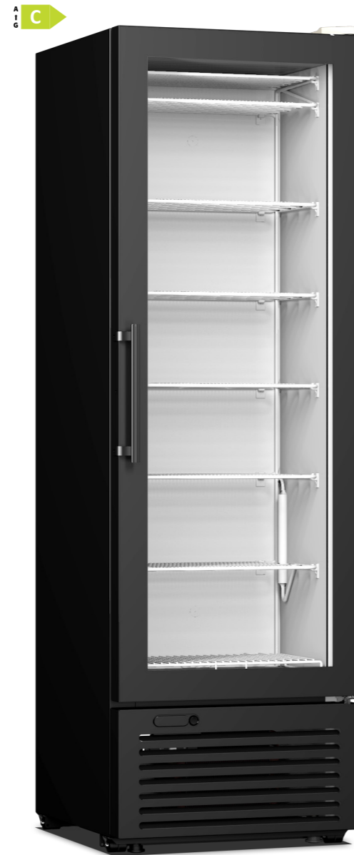
CRF 300 FRAMELESS 570 x 620 x 1835 301lt