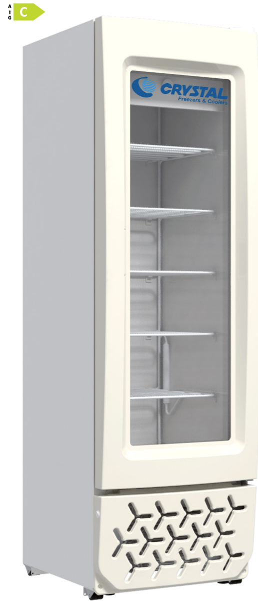
MIRA 570 x 649 x 1835 301lt