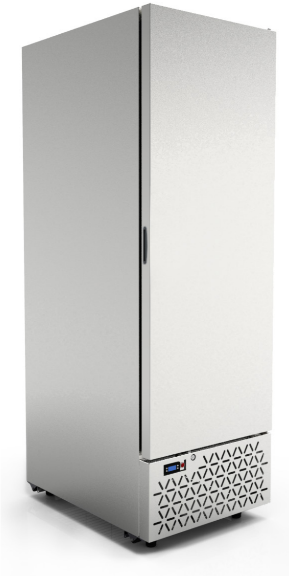
GELOBOX INOX 667 x 895 x 2020 658lt