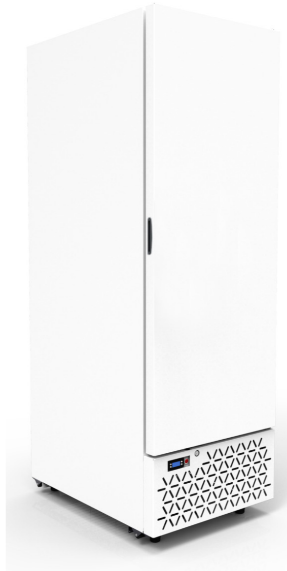
GELOBOX WHITE 667 x 895 x 2020 658lt