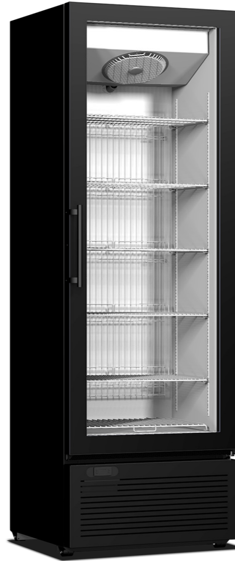
CRFV 500 FRAMELESS 667 x 680 x 2018 420lt