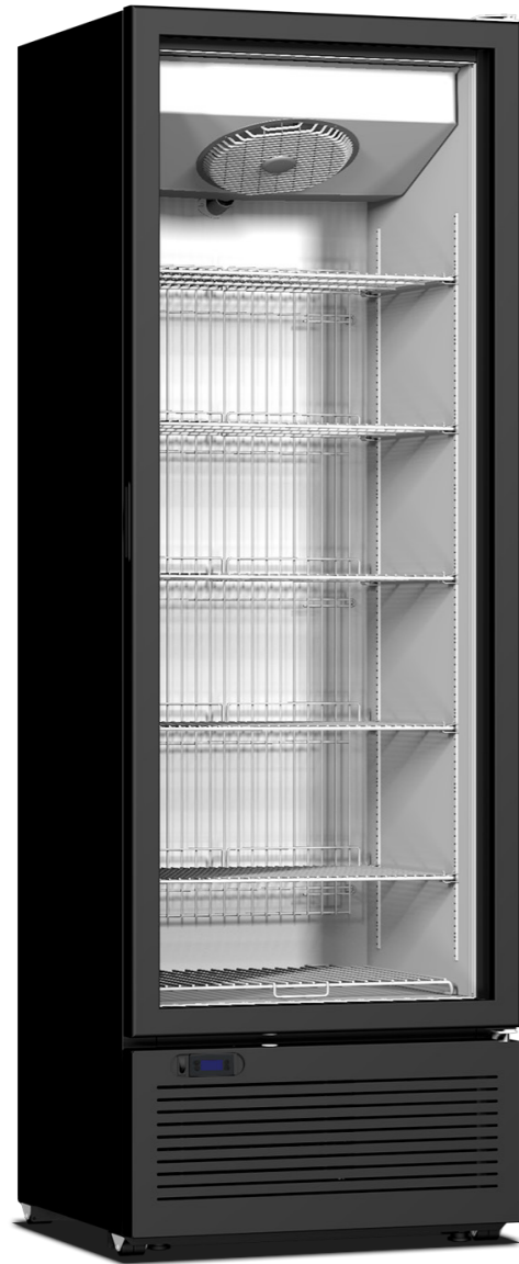
CRFV 500 667 x 680 x 2018 420lt