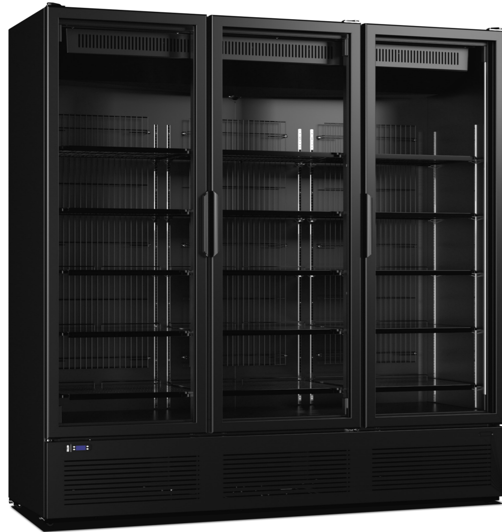
CRFV 2000 2040 x 768 x 2077 1786lt