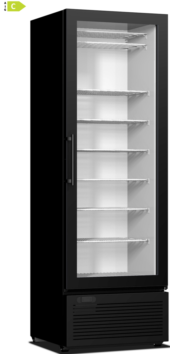
CRF 400 FRAMELESS 667 x 620 x 2018 417lt