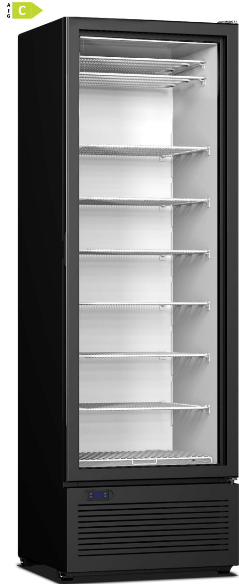
CRF 400 667 x 620 x 2018 417lt