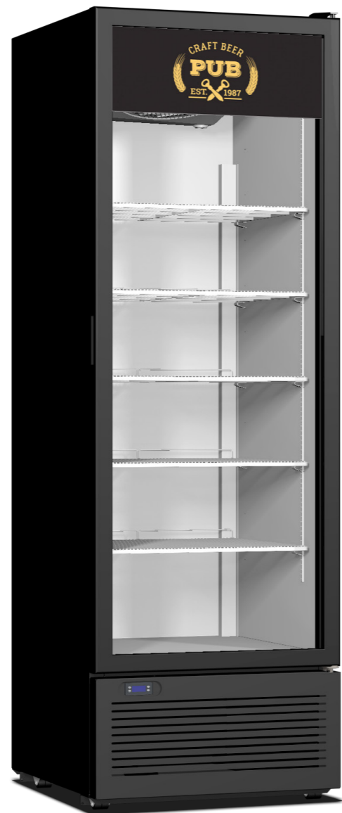
CR 500 SZ 667 x 620 x 2018 477lt