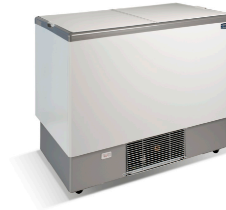
ATLAS 26 909 x 644x 999 246lt