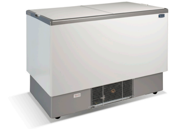
ATLAS 36 1184 x 644 x 999 328lt