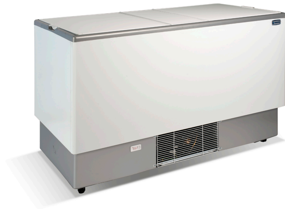
ATLAS 46 1439 x 684 x 999 438lt