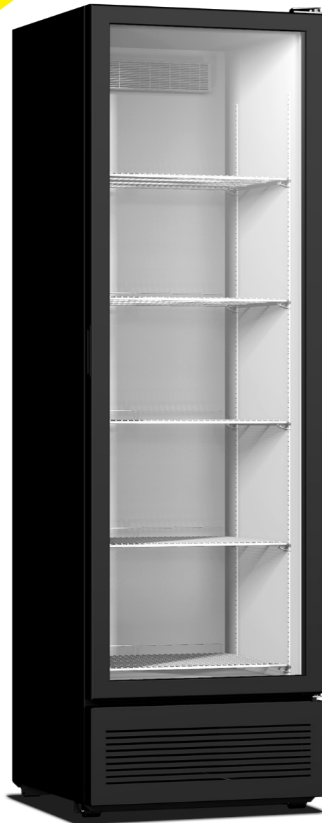
AMAZON ECONOMY 595 x 595 x2018 435lt