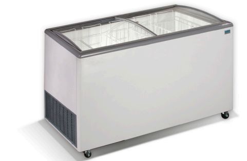
VENUS 46 SGL 1439 x 644 x 864 434lt