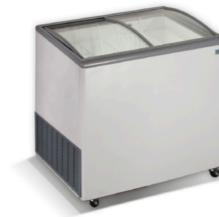
VENUS 26 SGL 909 x 644 x 864 240lt