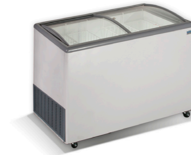
VENUS 36 SGL 1184 x 644 x 864 340lt