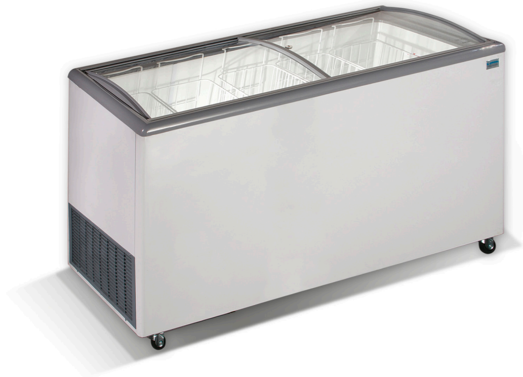
VENUS 56 SGL 1654 x 644 x 864 513lt