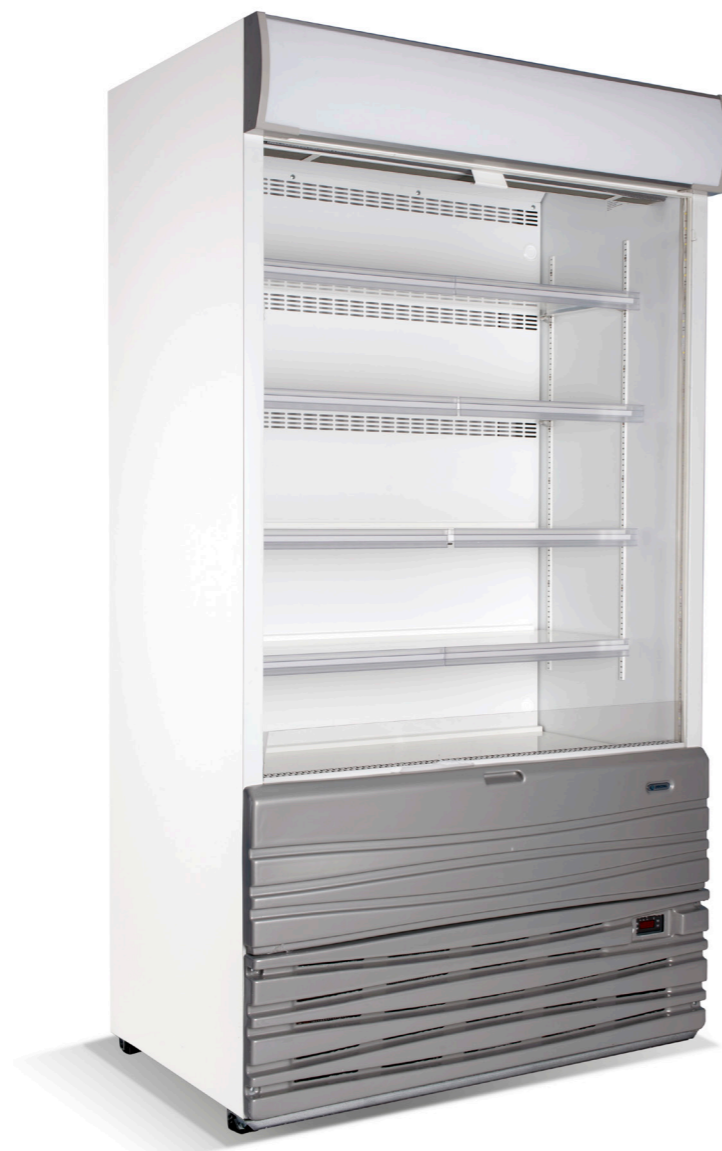
SNAP 100 1100 x 716 x 2059 794lt