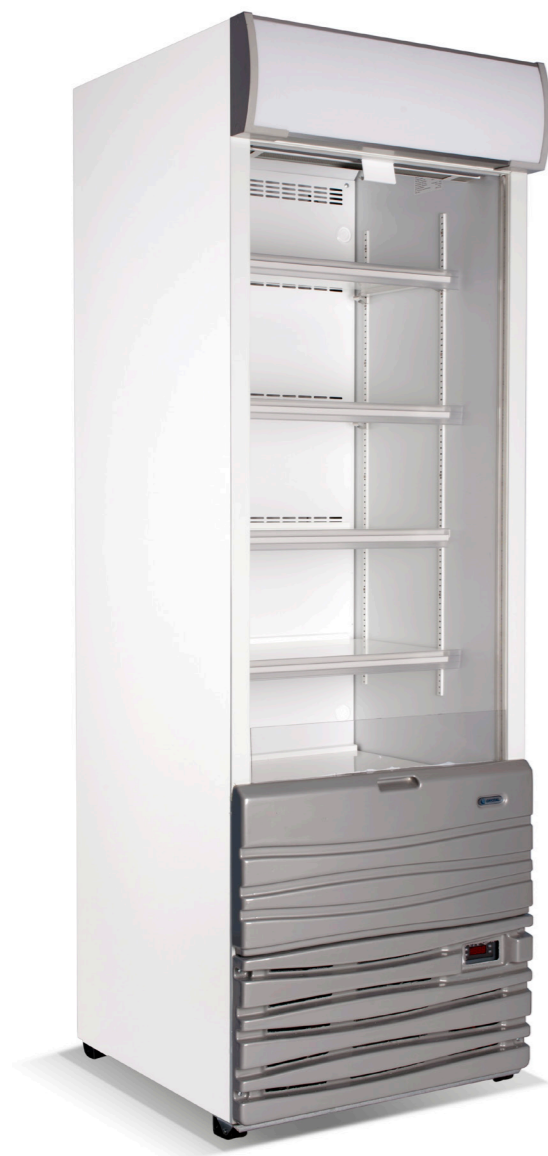
SNAP 70 667 x 716 x 2018 475lt