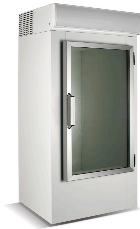
ICE BOX 24 GD 770 x 765 x 1902 590lt