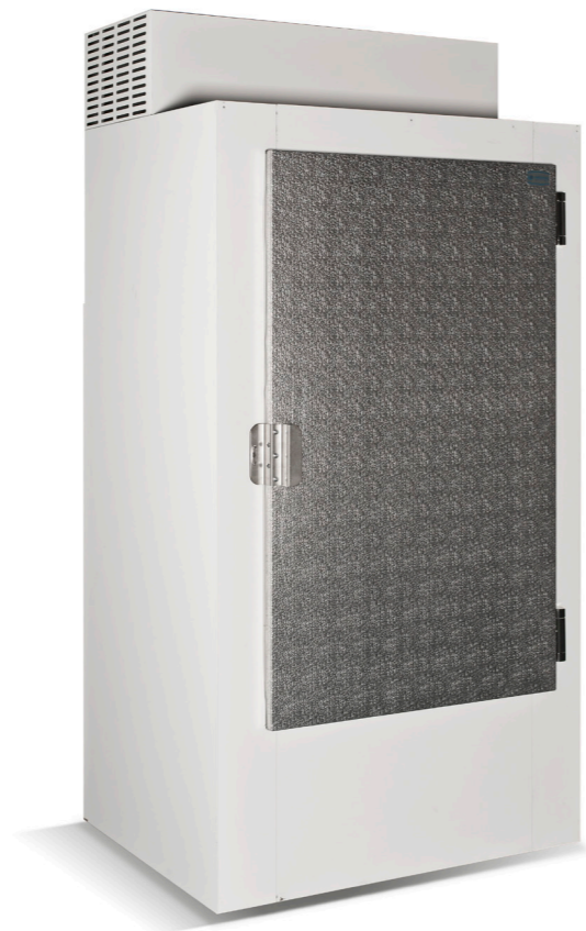
ICEBOX 30 900 x 765 x 1902 703lt