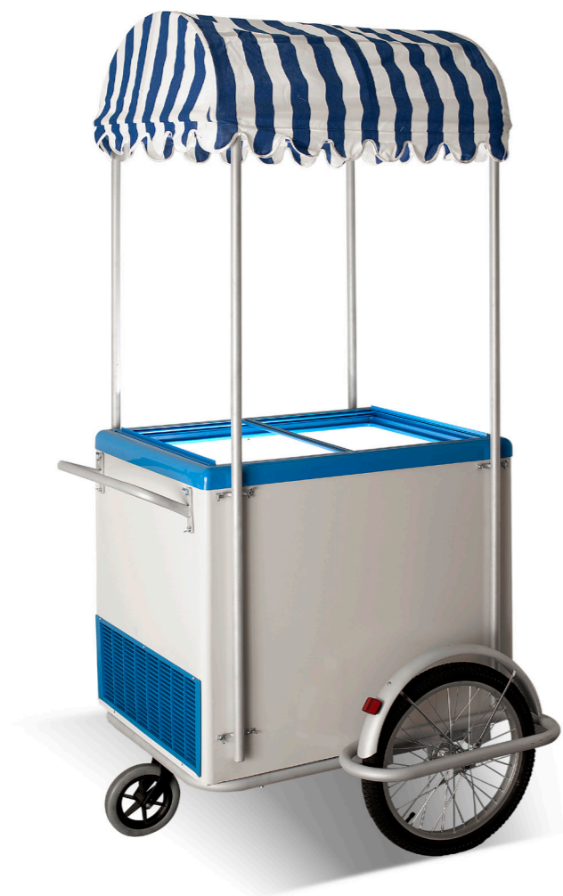
ICE CREAM CART 1050 x 1120 x 2300 6 places