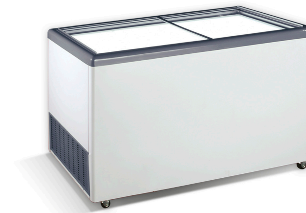
EKTOR 56 SGL 1654 x 644 x 895 535lt