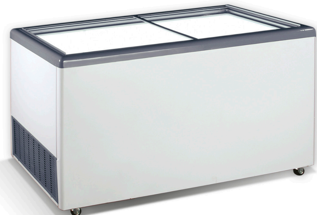
EKTOR 60 SGL 1754 x 644 x 895 575lt