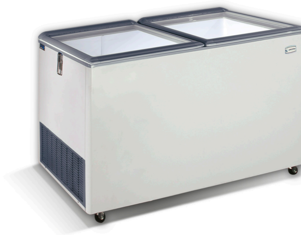
EKTOR 46 HGL 1439 x 700 x 894 448lt