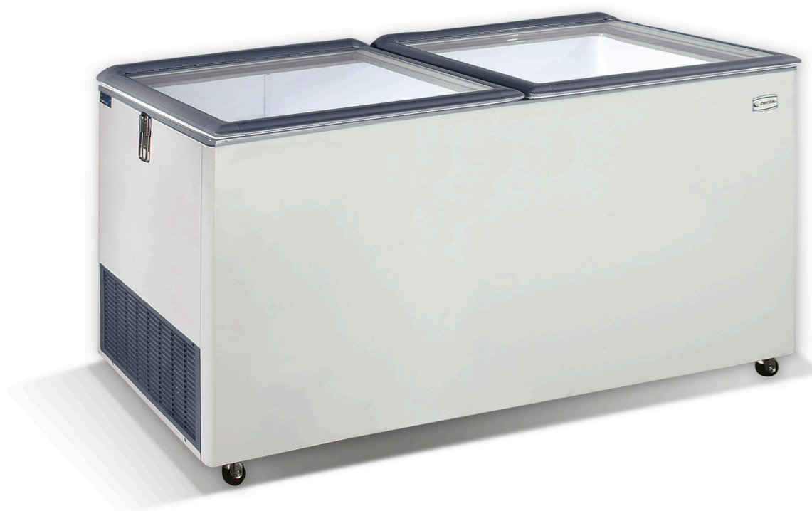
EKTOR 60 HGL 1754 x 700 x 894 575lt