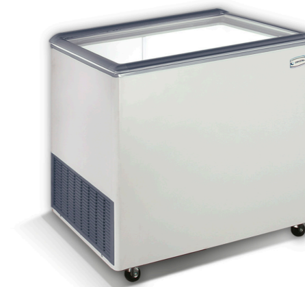
EKTOR 26 HGL 909 x 700 x 894 251lt