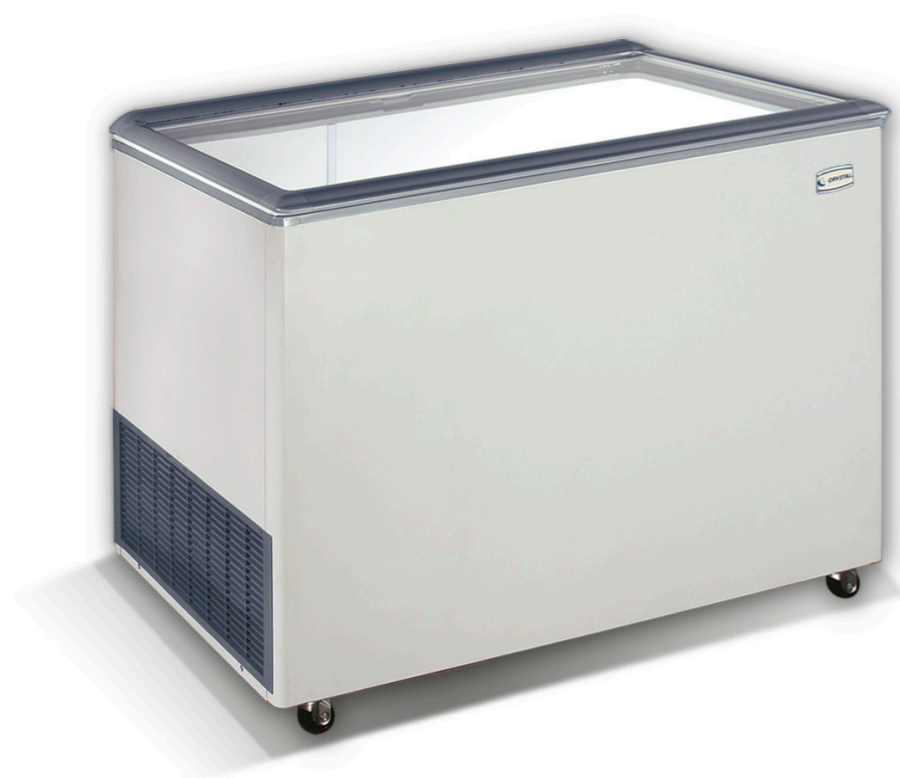
EKTOR 36 HGL 1184 x 700 x 894 356lt