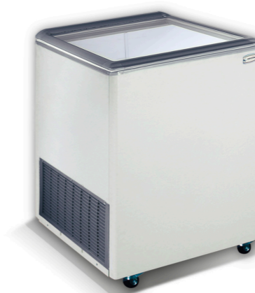
EKTOR 16 HGL 654 x 700 x 935 181lt

EKTOR 16 HGL • EKTOR 26 HGL • EKTOR 36 HGL