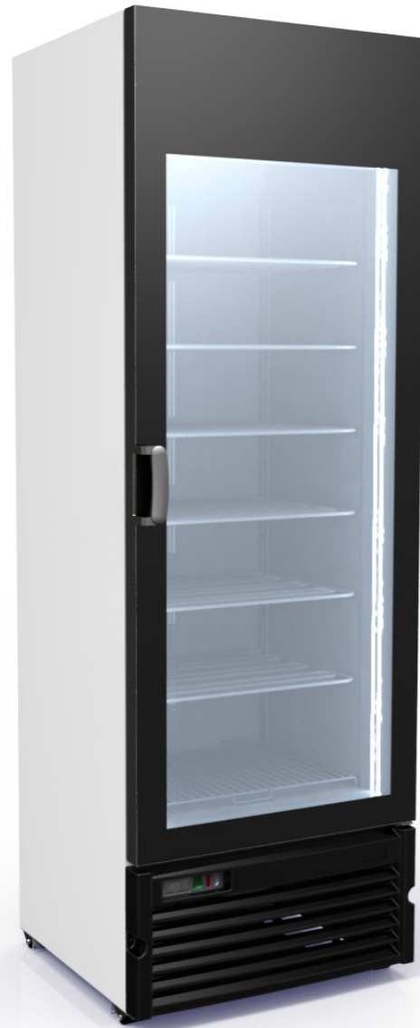
CRF 400 FRAMELESS 667 x 620 x 2018 417 lt