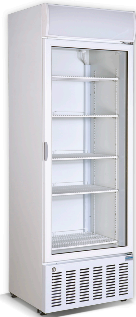
CR 500 667 x 620 x 2018 477lt