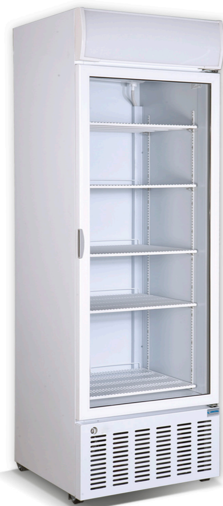
CR 600 667 x 716 x 2018 567lt