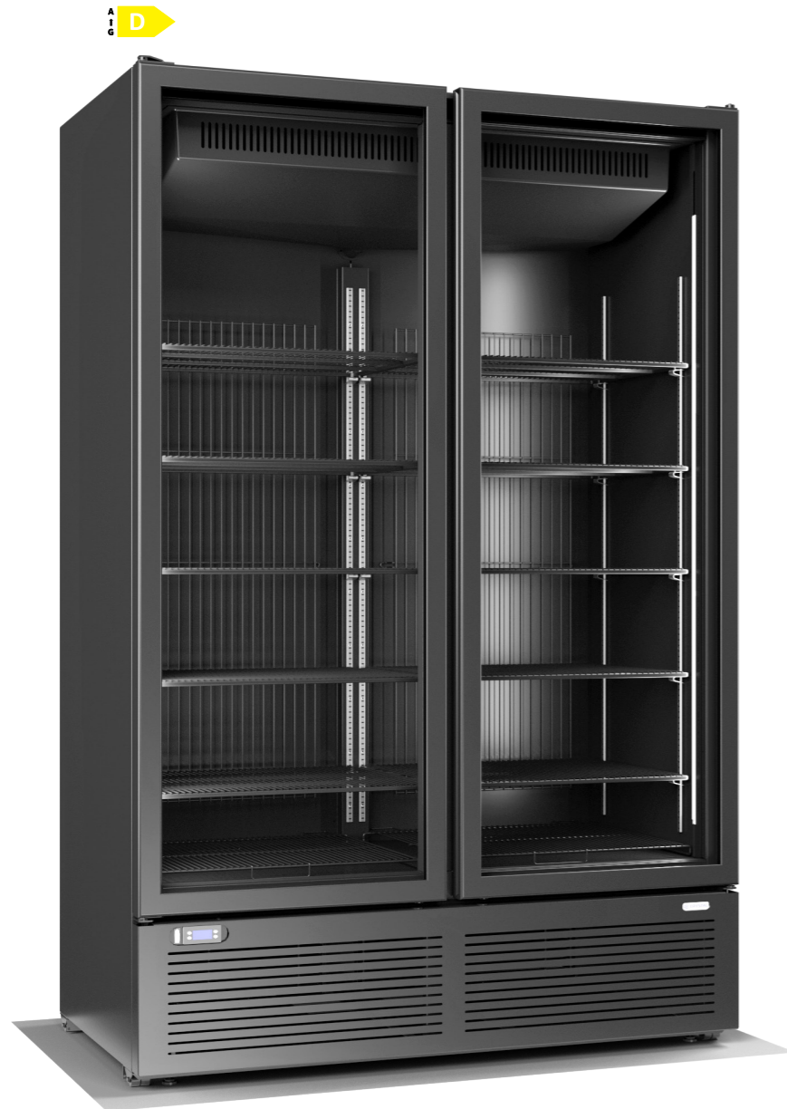
CRFV 1200 1370 x 760 x 2080 1163lt